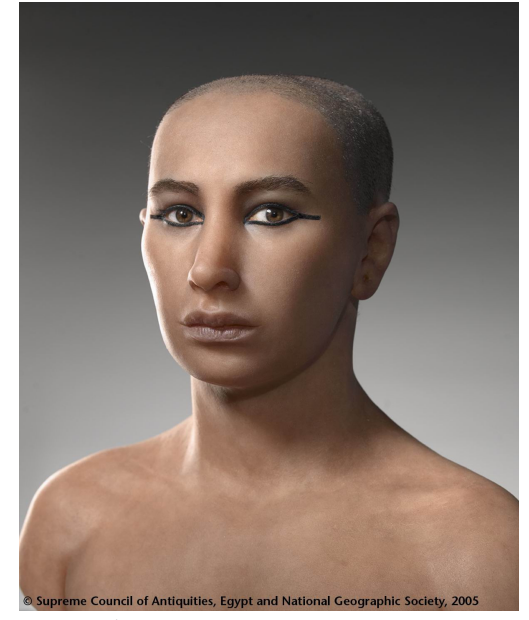
Reconstruction by the Egyptian Team