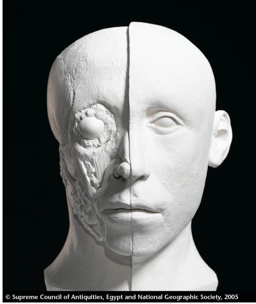
Reconstruction by the American Team

All three teams started with the CT data provided by the SCA. The American and French teams were given a plastic model of the skull produced in Paris; the Egyptian team made their own model directly from the data. Based on this skull, the American and French teams both concluded that the subject was Caucasoid (the type of human typically found, for example, in North Africa, Europe, and the Middle East). The American team, working blind, correctly identified the subject as North African.